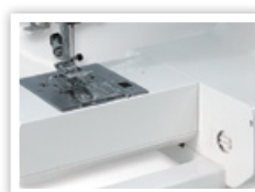
CONVERTIBLE FREE ARM