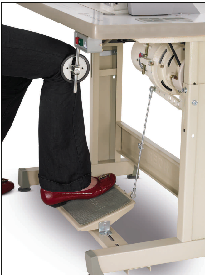
Included Presser Foot Knee Lifter