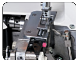
EASY ROLLED HEM