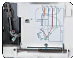
COLOR CODED THREADING