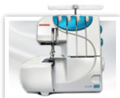
PAIRS WITH THE 4DLB SERGER

Key Features When fewer stitches meet your sewing needs, the 2030 QDC offers all of the basics with a splash of decorative and fun stitches.