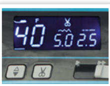
PUSH BUTTON THREAD TRIM